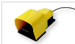
Foot switch with protection cover