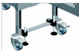
Fixable feet With adjustable feet the machine can be securely located