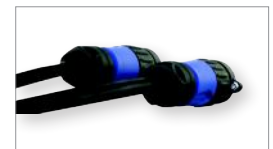
Interface for integration into existing production lines