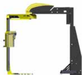
The rotating arm can be easily adjusted to achieve a wrapping diagonal of 2000 mm or 2300 mm ; offering extreme versatility at no additional cost.

Four individual wrap programs can be stored using the touch screen human machine interface (HMI) for simple operation of the machine. The programs include eight functions which can be adjusted to meet the demands of the most challenging applications.