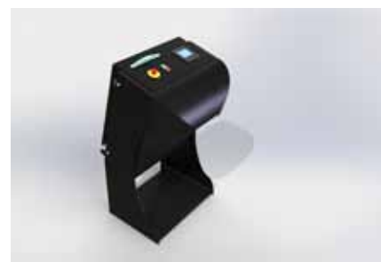
Easy to use for simple operation and maximum functionality. Adjustments for the number of wraps, wrap pattern, film tension, overlap, overwrap, and up/down speed are standard.