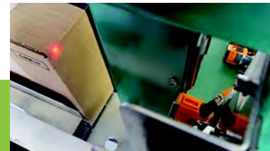
Strap is accurately position via a photo cell