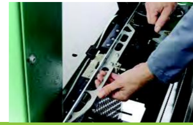
Easy access for maintenance without tools