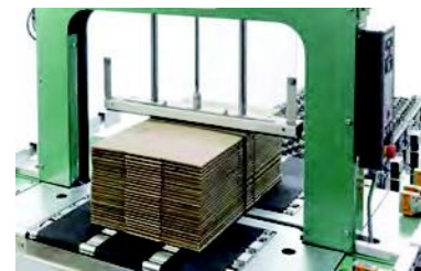
Compression bar holds pack secure during strapping