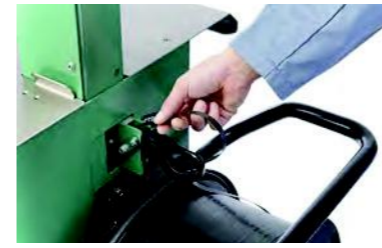
Simple and rapid coil changes