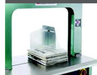
Optional bundle stops for precise positioning of loose packs

The SBM 4300 is the ideal solution for larger packages and is available in a wide range of sizes to suit different operational requirements. Operator controlled, it delivers strap tensions of up to 450N, at up to 65 cycles a minute. Coil changeovers are fast and simple via the side mounted coil dispenser.