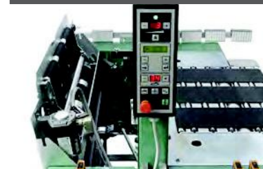
Exceptionally easy operation

The SBM 4330 is a high performance, fully automatic strapping machine that can be easily integrated within an existing conveyor lines, due to its adjustable speed integral conveyor and four locking casters. It offers a choice of strapping programs to suit all package types, all easily selected via the touch panel. Strap tension is also adjustable using the touch panel. The side-mounted coil ensures fast coil changes while the automatic strap threading and strap end ejection features help to increase machine availability still further.